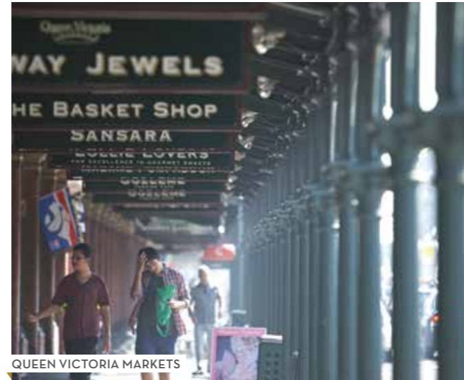
QUEEN VICTORIA MARKETS