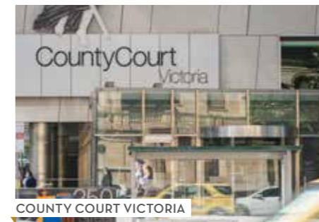
COUNTY COURT VICTORIA