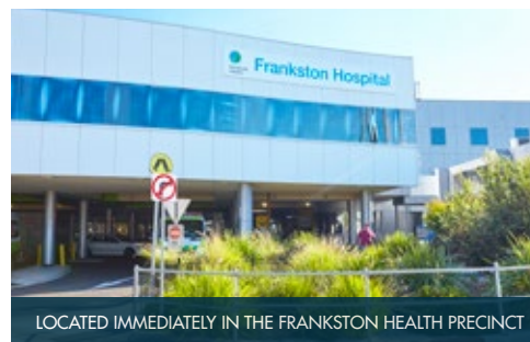
LOCATED IMMEDIATELY IN THE FRANKSTON HEALTH PRECINCT