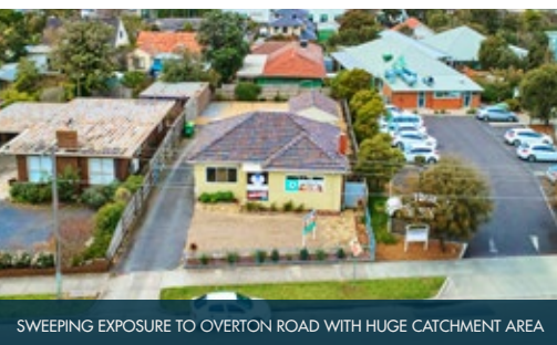
SWEEPING EXPOSURE TO OVERTON ROAD WITH HUGE CATCHMENT AREA