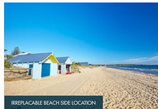
IRREPLACABLE BEACH SIDE LOCATION

FOR MORE INFORMATION, PLEASE CONTACT THE EXCLUSIVE SALES AND MARKETING AGENTS: