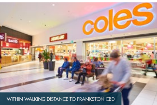
WITHIN WALKING DISTANCE TO FRANKSTON CBD

Linkages to major road networks connecting Melbourne CBD and the famed Mornington Peninsula