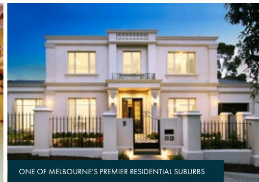
ONE OF MELBOURNE'S PREMIER RESIDENTIAL SUBURBS