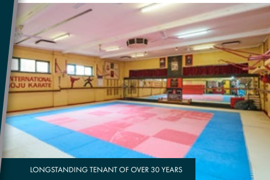
LONGSTANDING TENANT OF OVER 30 YEARS

EXECUTOR'S AUCTION WEDNESDAY 18 TH OCTOBER 2017 AT 12.30PM, ON-SITE