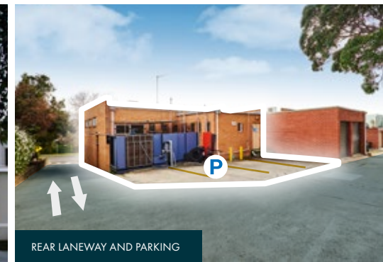
REAR LANEWAY AND PARKING

FOR MORE INFORMATION PLEASE CONTACT THE EXCLUSIVE SALES AND MARKETING AGENTS: