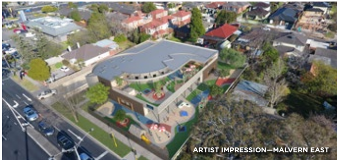
ARTIST IMPRESSION—MALVERN EAST