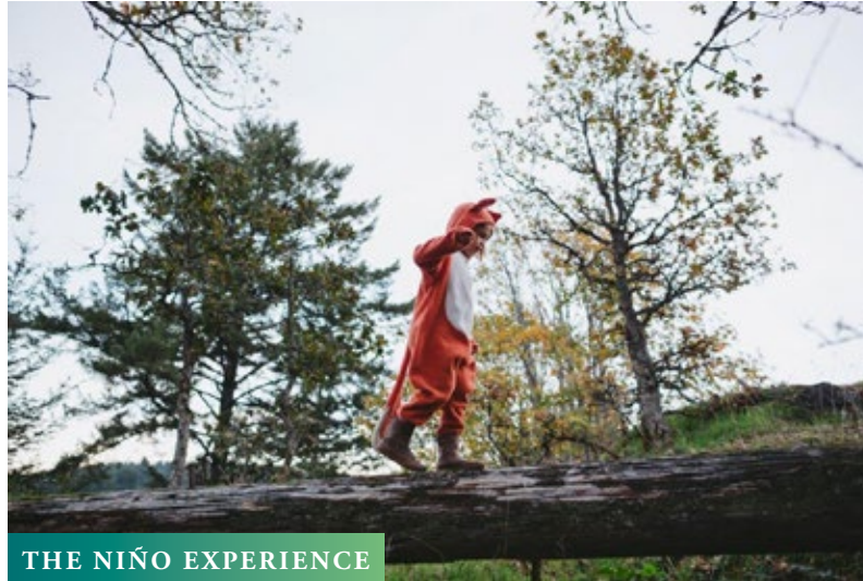
THE NIÑO EXPERIENCE