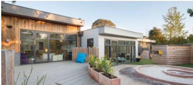
TYPICAL NIÑO CUTTING EDGE INTERIOR & EXTERIORS