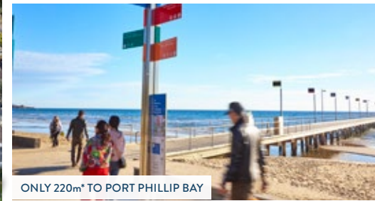
ONLY 220m* TO PORT PHILLIP BAY