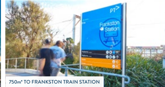
750m* TO FRANKSTON TRAIN STATION