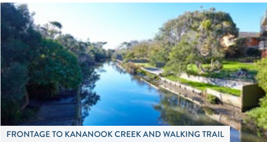
FRONTAGE TO KANANOOK CREEK AND WALKING TRAIL