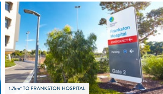
1.7km* TO FRANKSTON HOSPITAL