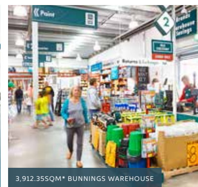
3,912.35SQM* BUNNINGS WAREHOUSE