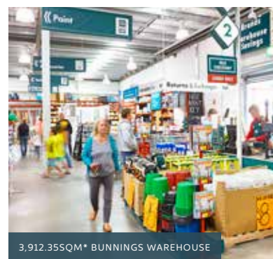
3,912.35SQM* BUNNINGS WAREHOUSE