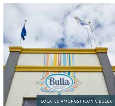
LOCATED AMONGST ICONIC BULLA ICE CREAM AND AUSTRALIAN LAMB CO

NET ANNUAL INCOME OF $475,090 PA* (JULY 2017)