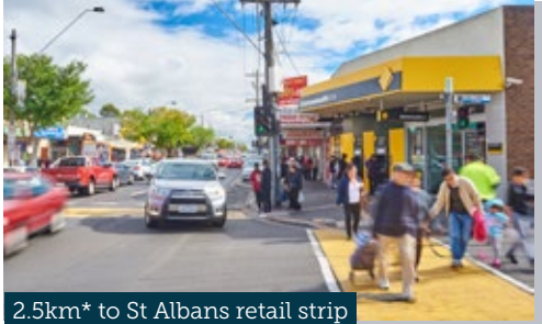
2.5km* to St Albans retail strip