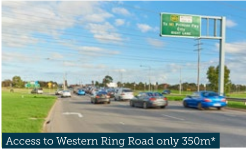
Access to Western Ring Road only 350m*