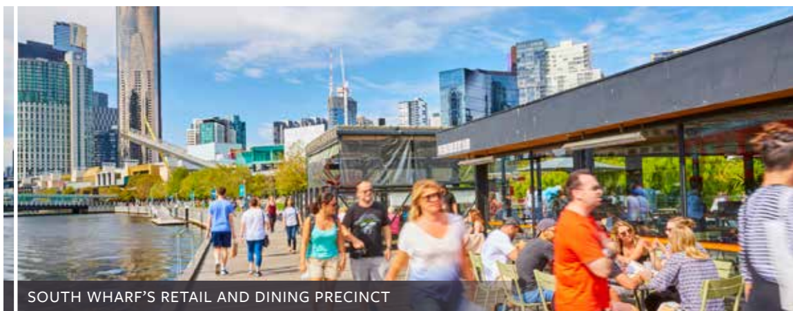
SOUTH WHARF'S RETAIL AND DINING PRECINCT