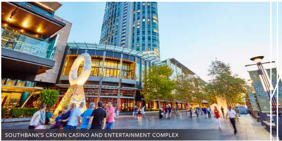
SOUTHBANK'S CROWN CASINO AND ENTERTAINMENT COMPLEX

SOUTHBANK MELBOURNE'S VIBRANT WATERFRONT CULTURAL AND COMMUNITY HUB IS RENOWNED FOR ITS ARTS PRECINCT, LUXURY RETAILERS AND WORLD FAMOUS DINING AMENITIES