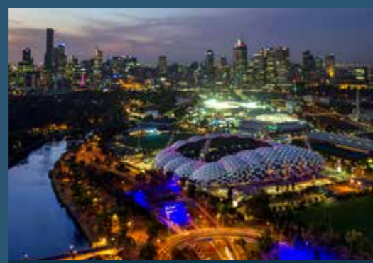
MELBOURNE SPORTING PRECINCT