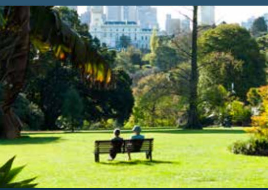
ROYAL BOTANIC GARDENS

Two highly advanced development schemes are available upon request; apartments and townhouses totalling over 10,000 sqm of NSA by Jackson Clements Burrows Architects and 41 townhouses by Cera Stribley Architects