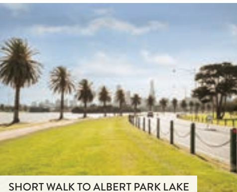
SHORT WALK TO ALBERT PARK LAKE