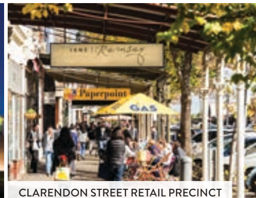
CLARENDON STREET RETAIL PRECINCT