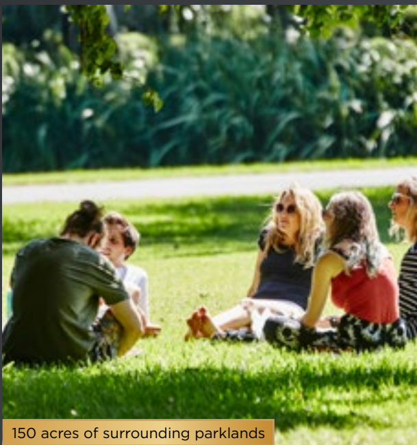
150 acres of surrounding parklands